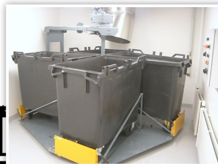
4MATIC™ - Automatic waste carousel