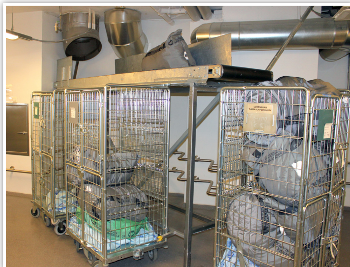
FLEXIBELT™ - automatic laundry sorting system